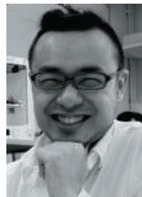
Laurin Lab CEO