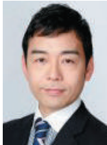
Sincere International Corporation

Small and Medium Enterprise Management Consultant, Administrative Scrivener, International Business Consultant