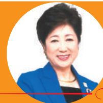
Tokyo Governor Yuriko Koike

The Tokyo One-Stop Business Establishment Center (TOSBEC) centralizes the procedures that foreign companies and start-ups need to complete to establish a business. This is the first such initiative in Japan, which was realized by employing the National Special Strategic Zone system. Through personalized services provided by experts and staff knowledgeable in administrative procedures, the center helps facilitate the prompt completion of various filing procedures required when establish a business and launching operations, including those for certification of articles of incorporation, company registration, taxes, social security, and immigration. On request, the center will also provide support for electronic applications as well as interpretation and translation services in several languages.